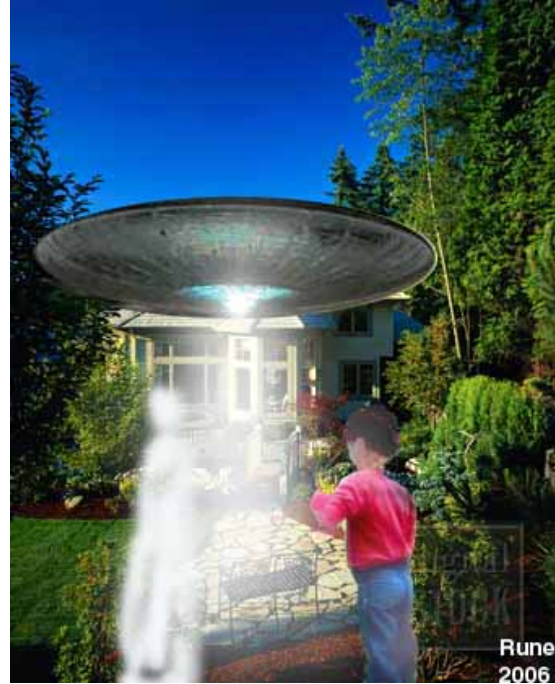
this picture not from the original book

cape, because there were no arms or legs to be seen.